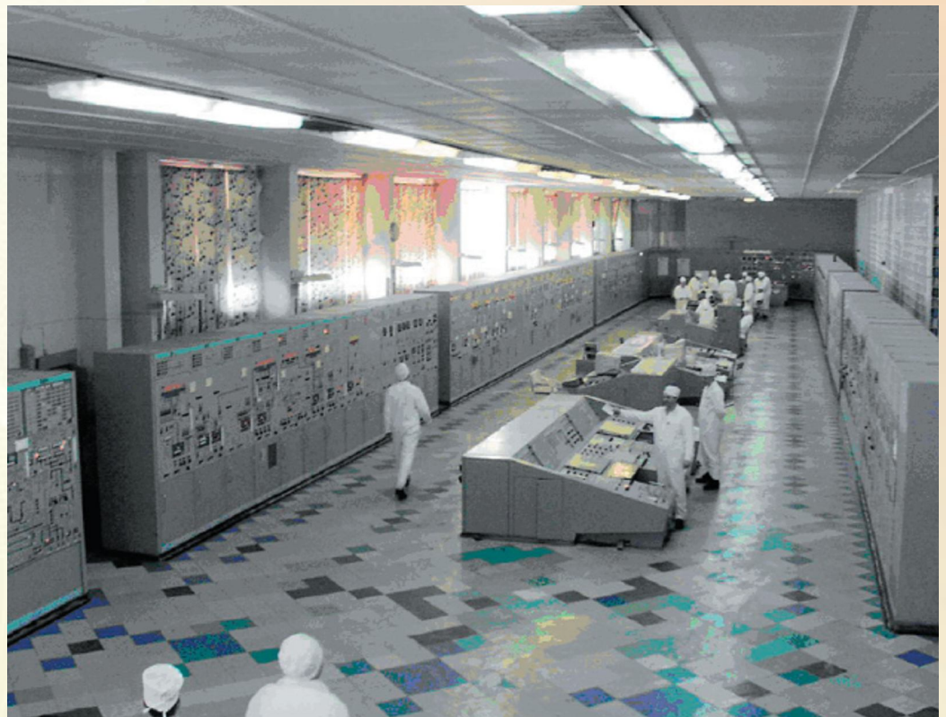
■ Control panel of the radiochemical production at the IF reprocessing plant from BBP-40 and naval reactors, Mayak PA, Ozersk, Chelyabinsk Region

Between 1957 to 1960, more than 10 million people were evacuated from the territory of the East-Urals Radioactive Trace and 119 thousand hectares of land were temporarily removed from the agricultural fund. Even today 16.7 thousand hectares of the East-Urals Radioactive Reserve are forbidden for agricultural activity. In other areas restored for agricultural use it is still necessary to constantly perform radioactivity checks of agricultural and forest lands, as well as checks on the products produced in these areas.